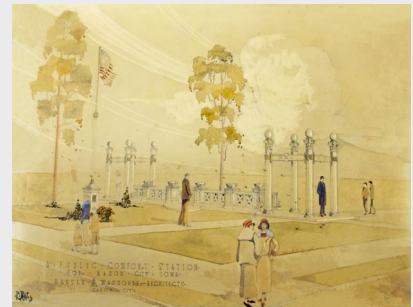
Hand drawn rendering of the Mason City Comfort Station from 1923

A more notable project included in our 100-year history is located in Clear Lake on Buddy Holly Avenue. Inducted into the National Register of Historic Places and the American Rock & Roll Hall of Fame, we are, of course, referring to the Surf Ballroom.