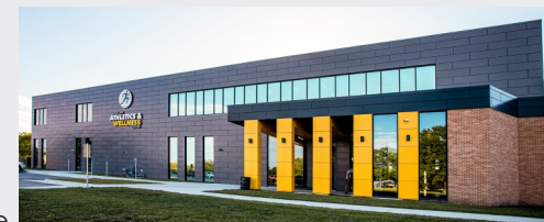
Recently completed design project: Clear Lake Athletics & Wellness Center

Today our firm has grown to a full-service design staff of 12 employees with an array of experience and tenure within the company. We continue to work in both the private and public sectors alongside DSC and other contractors on design-build projects as well as maintaining our relationships with many north Iowa K-12 schools. We have become a go-to firm for design in childcare facilities, gymnasiums and other athletic facilities, and transportation storage. We anticipate 2023 to be a record year for square footage designed and includes some exciting projects that will transform the landscape of our local communities. One thing that has remained at the core of our culture through the last 100 years is the respect and relationships we build with our clients.