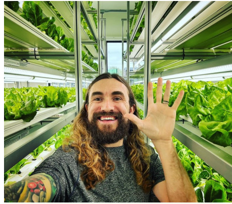
(Above) In early May, Clayton Farms Salads celebrated selling their 5,000th salad and smoothie.

When it came time to expand their business plan, DSC was back onsite, but this time in Ames, Iowa, remodeling the entire dining area of a previous Fazoli's building so that plant racking could be installed. Each level of racks grows leafy greens and microgreens. When the greens are ready, staff harvests it and places them straight into the salads and smoothies they serve right there on site.