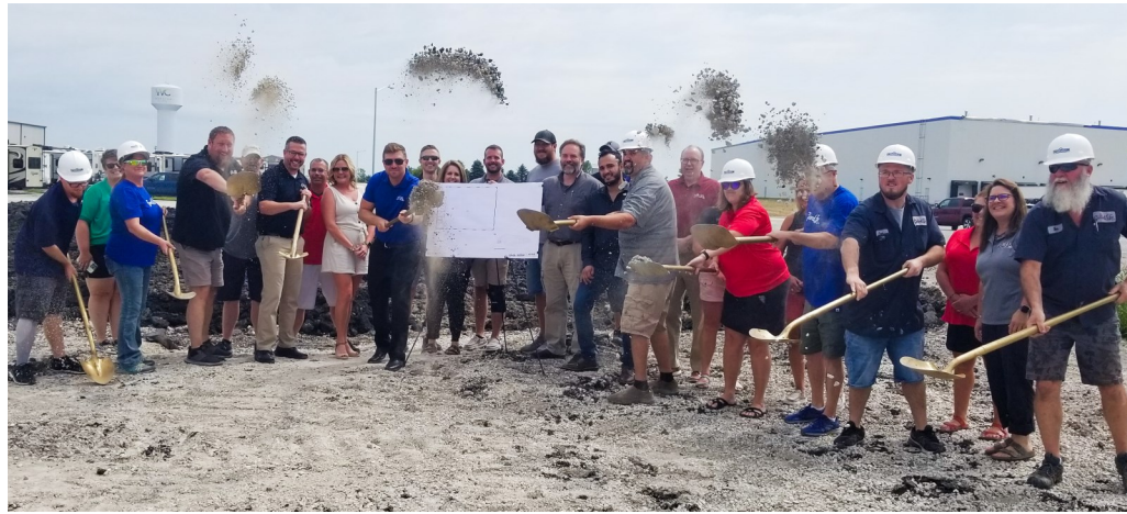
DSC's project with Good Life RV broke ground in August and will double their capacity for RV services.

The new Altoona Kwik Star held their grand opening on September 16. DSC built a total of three Kwik Star stores this summer in Iowa including additional locations in Perry and Ames.