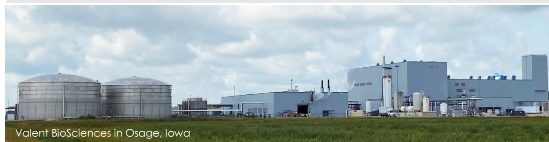
Valent BioSciences in Osage, Iowa