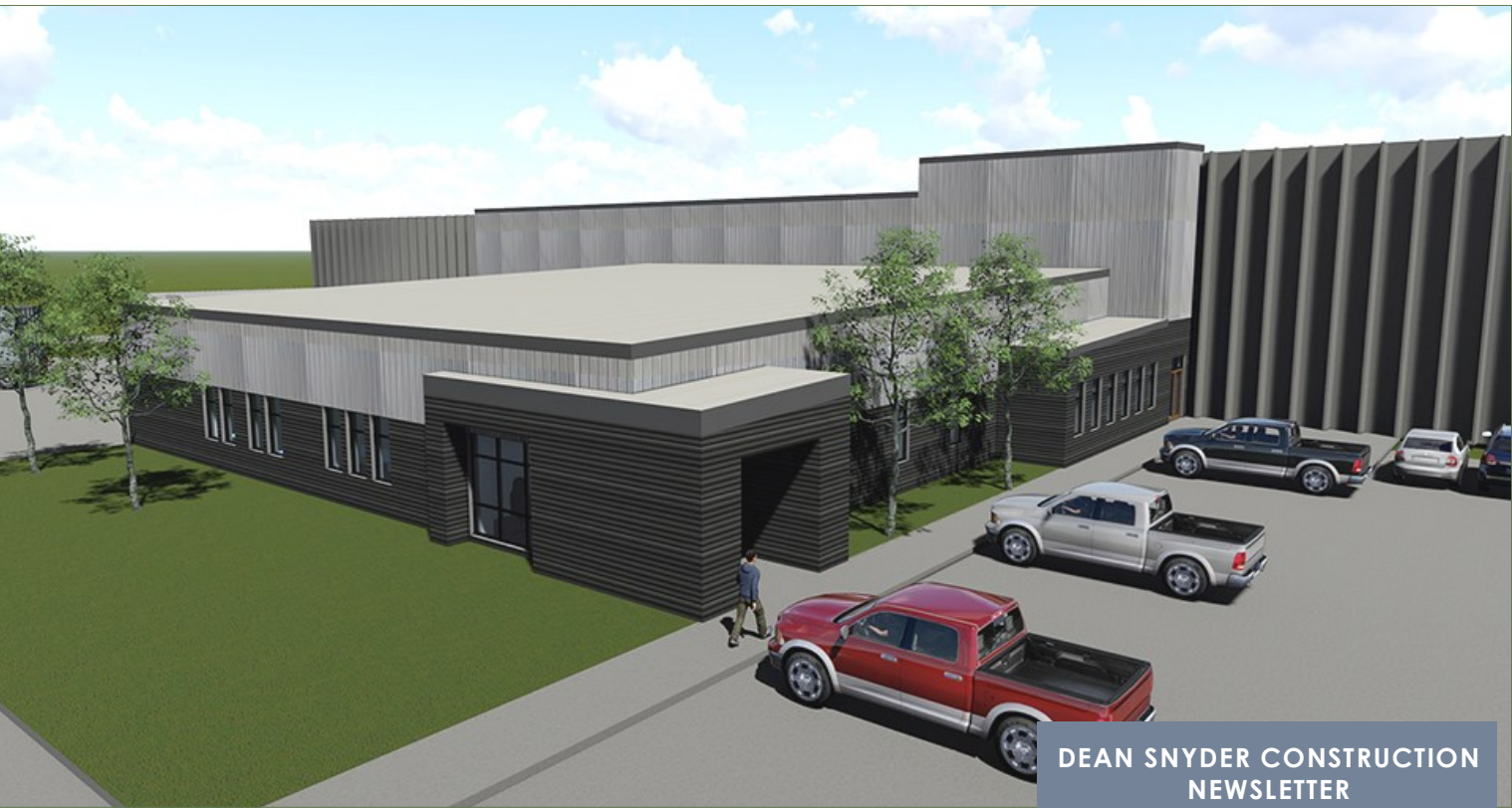
Above: Rendering provided by ATURA architecture of the new welfare expansion project at Hormel Algona (IA) Plant.

In order for their plant to cut down on cross-contamination between their raw and ready-to-eat products, Hormel is adding a 2-phase "welfare expansion" project at their Algona, IA, pepperoni facility.