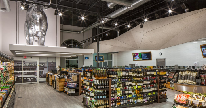
Fareway's stand-alone Meat Markets offer a fresh meat counter, seafood, sushi, artisan cheeses, wine, craft beer, among other quick items.

DSC recently completed construction of a 6,000 SF Fareway Meat Market in Omaha, a new 21,000 SF Fareway Grocery store in northwest Omaha, and is currently the general contractor for a 21,000 SF Fareway Grocery in Gretna, a short drive southwest of Omaha.