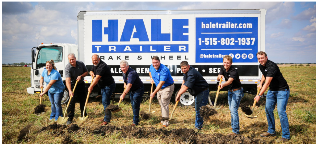
DSC's project with Hale Trailer Brake & Wheel broke ground in October 2021 and is set to be complete this spring.