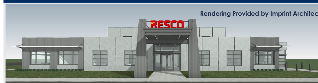
Rendering Provided by Imprint Architects