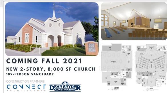
COMING FALL 2021 NEW 2-STORY, 8,000 SF CHURCH 189-PERSON SANCTUARY