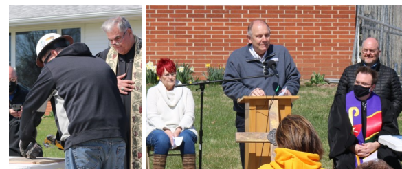
CONSTRUCTION PARTNERS CONNECT ARCHITECTURE DEAN SNYDER CONSTRUCTION