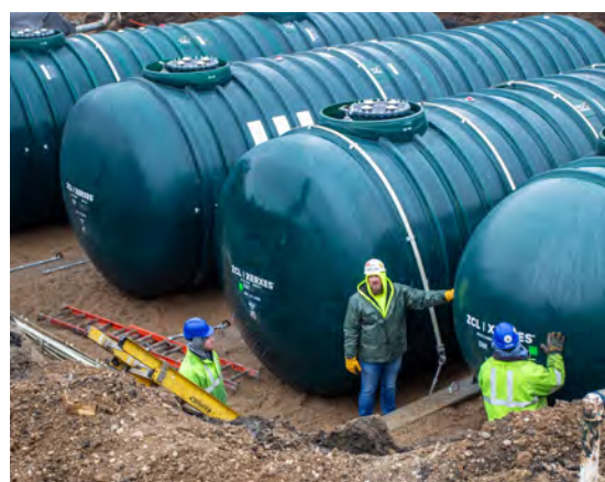
Kwik Star underground fuel tanks installation

DSC broke ground on a new Fareway Store to be located in Byron, MN. The 21,000 SF Fareway grocery will include a Spirits & More store as well as their normal full-service meat department and farm-fresh produce. This comes after the city's only grocery store 'The Market Place' closed last summer. The store is expected to open in late summer. Fareway Stores, Inc. is a growing Midwest grocery company currently operating 122 stores located in Iowa, Illinois, Minnesota, Nebraska and South Dakota.