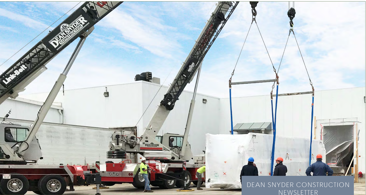
DSC crews unloaded and moved a 67,000 lb. piece of equipment into Kraft Heinz - Mason City in May.