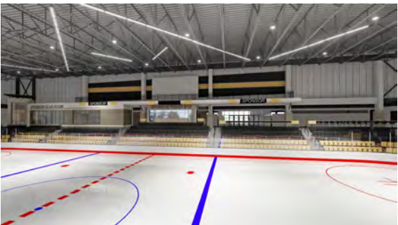
Renderings provided by ICON Architecture