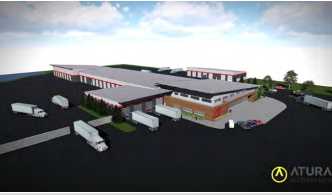
Rendering of completed expansion project in Altoona designed by ATURA architecture

Crews will also be remodeling a portion of the existing building to include a service write-up area. The next phases include more service bays, an office expansion, and a detail building.