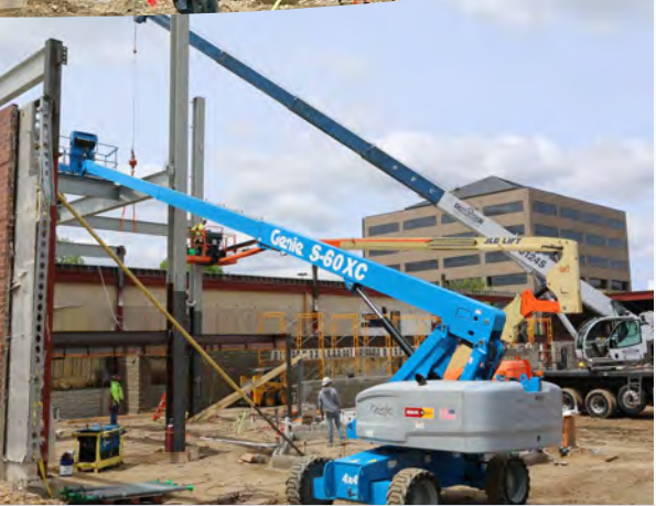
DSC is onsite for a new multi-purpose arena in downtown Mason City in the former JCPenney's store.