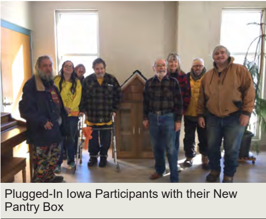
Plugged-In Iowa Participants with their New Pantry Box