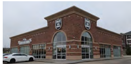
Opened last fall Fareway's 2nd Meat Market - Lincoln, NE