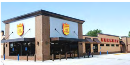
New 30,000 SF Fareway - Des Moines, IA

New Meat Market Under Construction DSC crews started this spring on the remodel of an existing building for a 5,000 SF full-service meat market at 3720 Lincoln Way in Ames. This will be Fareway's third meat market store and the first in Iowa. DSC also built the one in Omaha, NE and in Lincoln, NE.