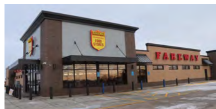
New 19,000 SF Fareway - Harrisburg, SD