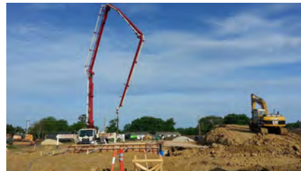
Under Construction - Cedar Falls Fareway

New Cedar Falls Fareway Under Construction DSC crews broke ground this May on a new 21,000 SF Fareway grocery store in the Pinnacle Prairie area of Cedar Falls at the intersection of Green Hill and South Main. It has been recognized as a WORKSAFE Project by MBI.